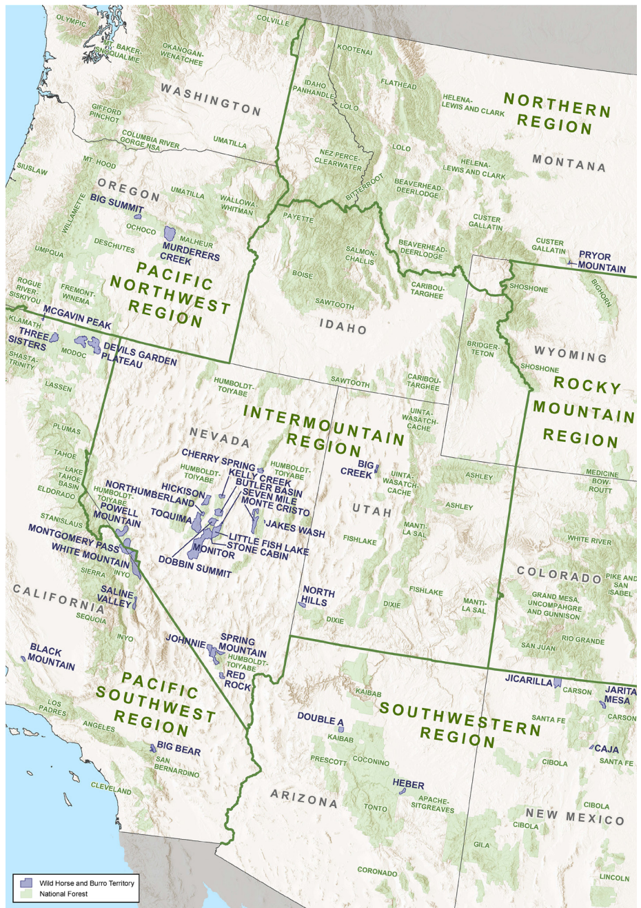
A map of the active wild horse and burro territories in the USDA Forest Service.

The USDA Forest Service Wild Horse and Burro Program objective is to maintain thriving, wild free-roaming horse and burro populations in ecological balance with national forest and rangeland ecosystems.