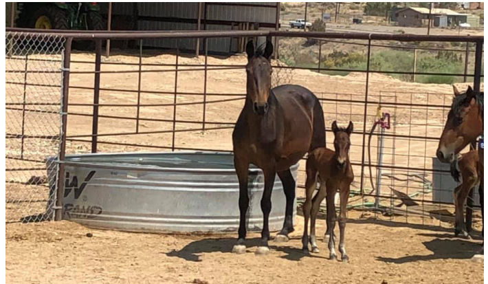
Mares and colts at the Bloomfield, NM, corral in Carson National Forest.

Modoc National Forest is home to the temporary Double Devil Wild Horse corral system that could be expanded or made more permanent.