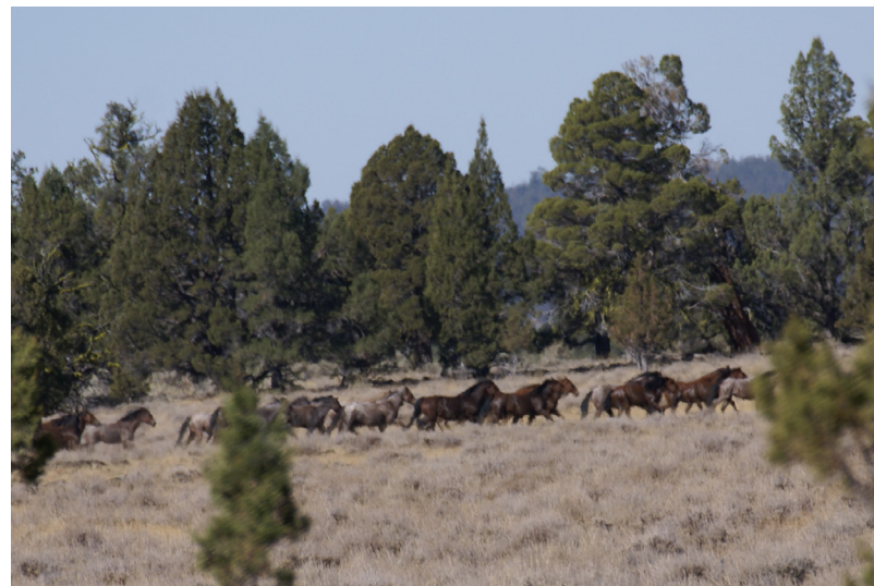
Horse herds can become a nuisance for land owners if not managed properly.