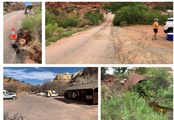
Calf Creek Road Repair

In FY21, the Escalante, Utah region experienced two flood events causing multiple facility issues at the Calf Creek Recreation site. One weather event undercut the access road creating the potential for road failure and a public health and safety issue. Recreation fee revenue and cooperation with a neighboring BLM district supported road stabilization and preserved recreational access.