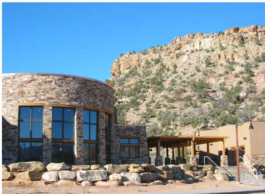
Escalante Visitor Center

During FY21, GSENM focused recreation fee revenue on labor for interpretation and educational outreach, processing special recreation permits, and conducting annual building maintenance. GSENM relied heavily on recreation fee revenue to pay for labor and operations at high-use recreation sites.