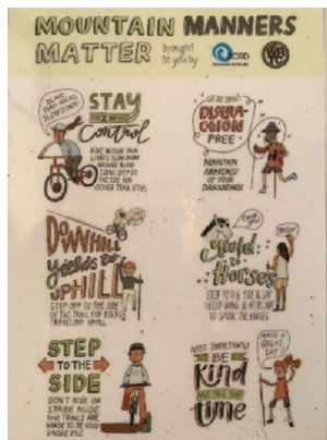
Trail Manners Poster

The International Mountain Bicycling Association assistance agreement will help support trail construction within the Wood River Valley. Funds were obligated to this agreement in FY21 and trail construction began in early FY22. Blaine County Recreation District (BCRD) Assistance Agreement is a multi-year agreement that assists with education and outreach efforts regarding trail conditions in the Wood River Valley along with assisting in maintenance of BLM trails.